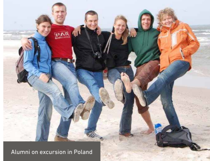
Alumni on excursion in Poland

During the fellowship practical solutions for current environmental issues are developed. After their stay in Germany the alumni are well qualified to tackle these issues in their home countries thus assuring efficient knowledge transfer. Working closely together in an international context helps to breakdown existing barriers. The acquired contacts will create a strong network of highly committed environmental experts.