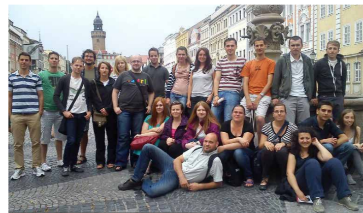
Fellowship recipients during a city tour